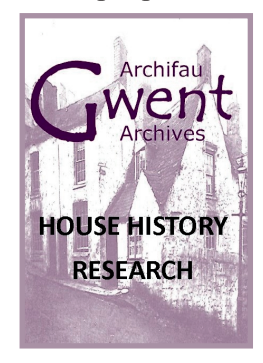
Some of the helpful research guides on the website www.gwentarchives.gov.uk